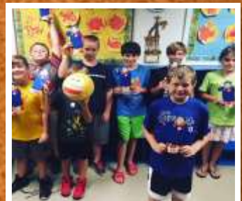
56er's Youth Night Class