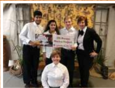
Serving at the Out of Africa Experience