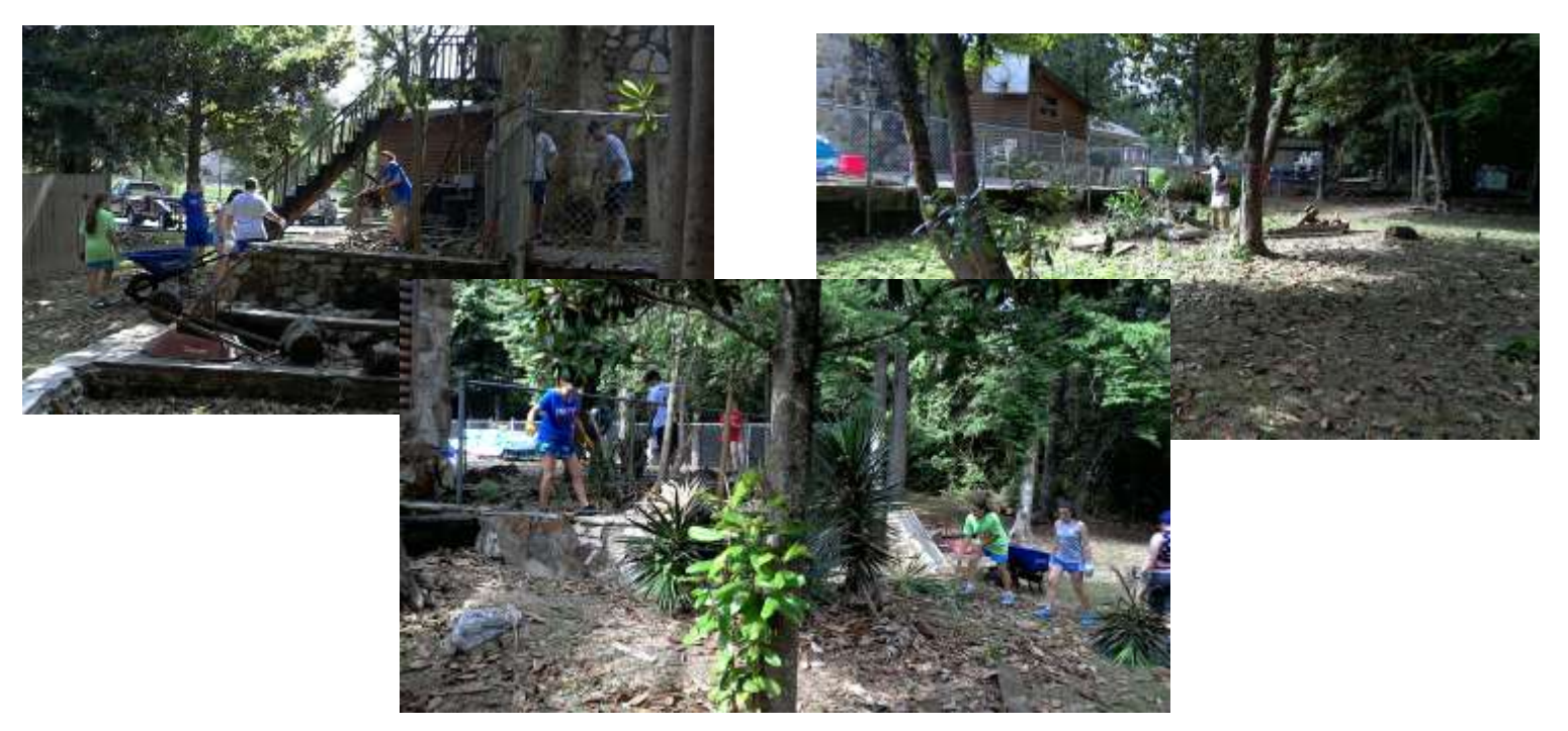
A huge THANK YOU for the 20+ youth & adults who showed up to help transform the back for the new youth Area!

Our next work day will be June 23rd we need "MUSCLES & SAWS" as we still have at least 3 fairly large trees to take down before we can bring in the heavy machinery to grind the stumps & start leveling the ground. We can use lots of hands on the 23rd as there are some other things that we need to take care of as well.