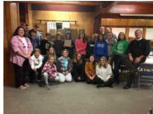
Hosanna Youth put together boxes to bless Mariners on the river that cannot make it home for Christmas! See page 6 for more details.

Home is Church Too! Each month, a newsletter will arrive with ideas for gameplay with your child, prayers, blessings, and they are all developmentally appropriate for your child's age. If you would like your child to be a part of this program, please see contact the office.