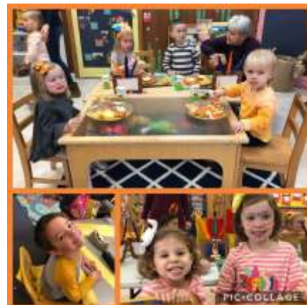
A few pictures of the Thanksgiving meal served to the preschoolers during the Thanksgiving season!