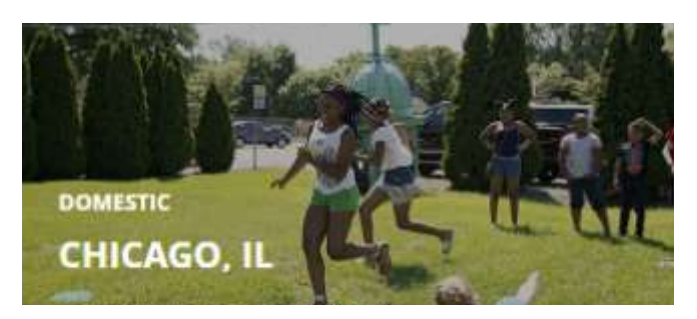
Senior Youth Missions Trip 2019